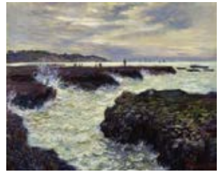
The Rocks at Pourville, Low Tide , Claude Monet