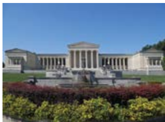
Buffalo AKG Art Museum

AAMD will continue to generate its annual publications and grant programs to advance member museums and support the larger art museum field. To learn more about AAMD and supporting the arts, visit aamd.org .