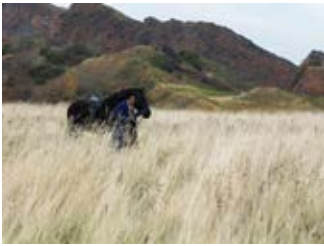
Lessons of the Hour —Frederick Douglass, Isaac Julien

Annual membership in the Director's Circle is essential to MAG's continuation of innovative exhibitions and programming, as well as the vitality of our museum. Your philanthropic support at this leadership level enables MAG to conduct new research, publish original scholarship, and mount stunning exhibitions that offer something for everyone—from familiar masters like Monet to pioneering media artists like Isaac Julien.