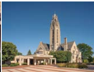
Memorial Art Gallery