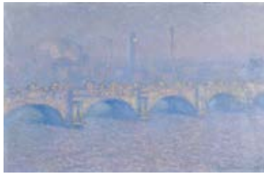
Waterloo Bridge, Veiled Sun , Claude Monet