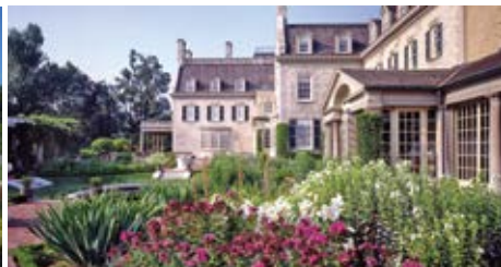
George Eastman Museum