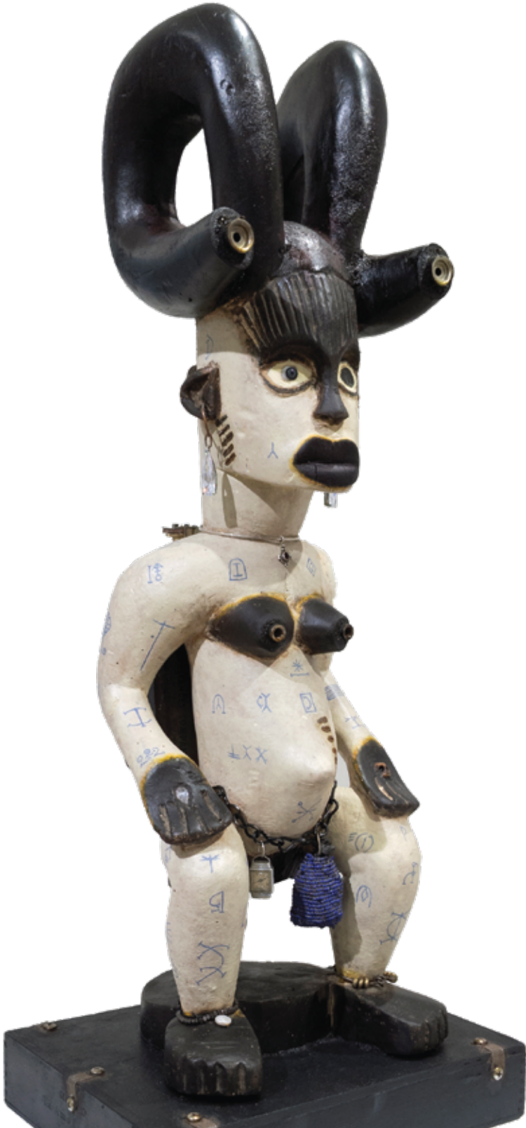
Ikenga , 2022 Renée Stout