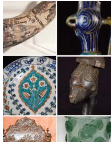
Art-Spot: Useful & Beautiful

We are excited to introduce a series of special themed Art-Spots in conjunction with our multi-gallery installations Represent: Great Women Artists at MAG . You will see a new version released every two to three months during the run of the exhibition—try one, any, or all and turn your MAG visit into an exploration!