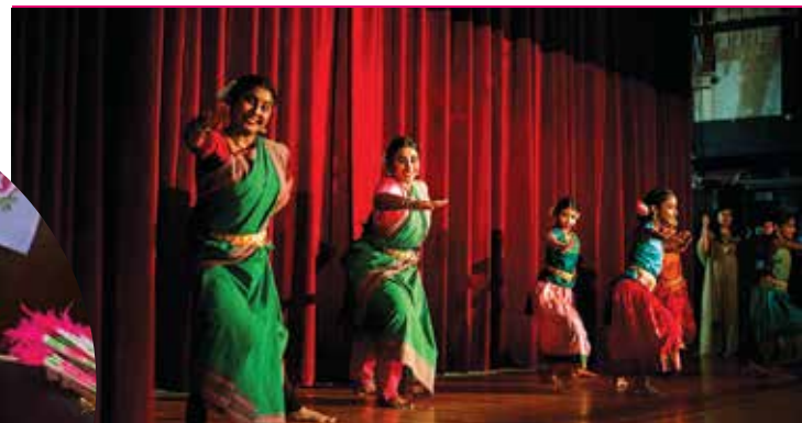
left: MansaWear Fashion Show