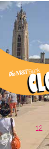
below, right: The Gallery Council's Annual Fine Craft Show & Sale