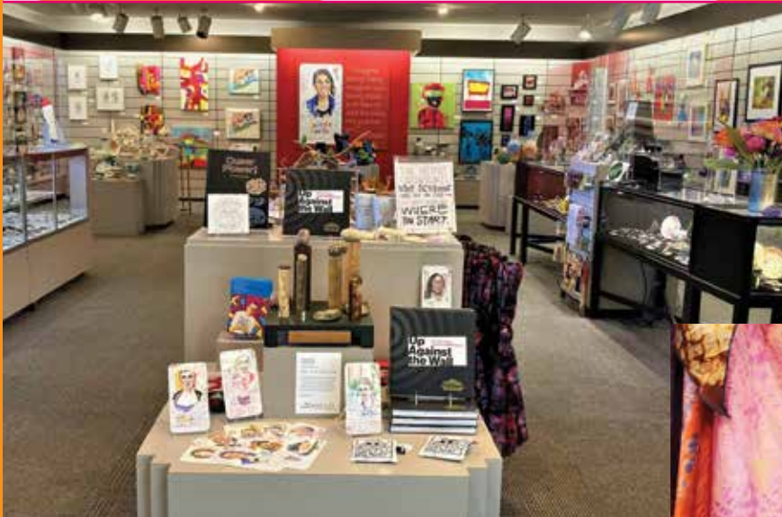
left: THE STORE @ MAG

This year, more than 1,000 people donated their time and energy to help further the mission of the Memorial Art Gallery. Our volunteers are a crucial part of the MAG team and help in all areas across the museum, including day-to-day operations, special events, and everywhere in between. All volunteers receive on-site training and an invitation to an annual volunteer recognition reception. Volunteers who work more than 100 hours annually receive discounts at THE STORE @ MAG and free or reduced admission to museum events.