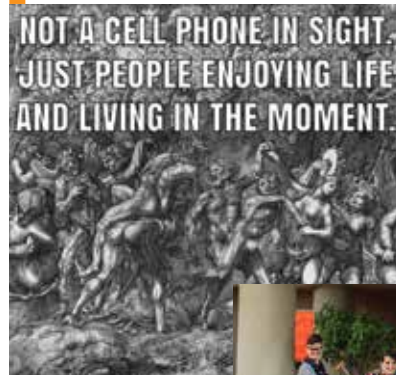
left: Example of social media post on Instagram