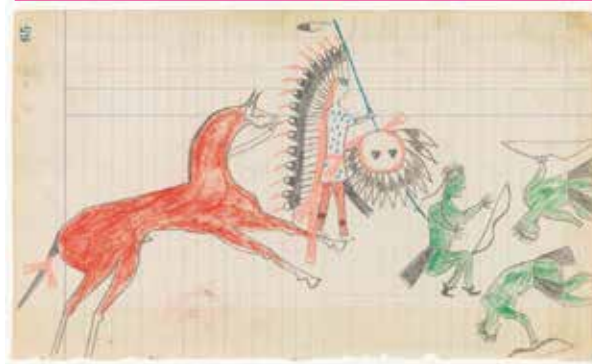
left: Attributed to Cedar Tree, Drawing from Cedar Tree Ledger Book, ca. 1880. Crayon and graphite on lined paper. Virginia Jeffrey Smith Fund, 2022.36

FY22 saw the completion of a major storage renovation project in Small Object Storage, which was funded through an IMLS grant in the amount of $96,300. The project included a complete renovation of the storage space, as well as the rehousing of over 2,000 objects, greatly improving the storage conditions and increasing the capacity of the space.