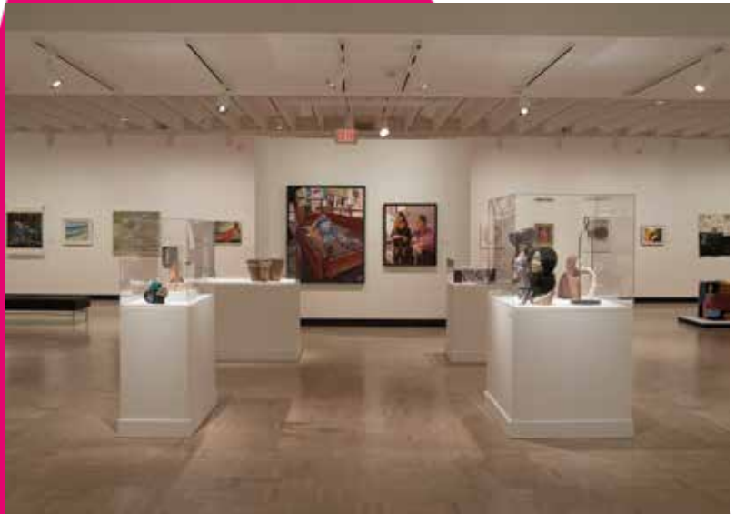
above: 67th RFLX in the Docent Gallery