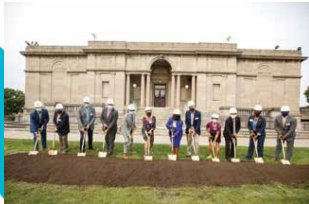
left: Groundbreaking for Phase II of the Centennial Sculpture Park, September 13, 2021

We are deeply grateful for all gifts, large and small. In this publication we recognize the following organizations and individuals who donated $25,000 or more in fiscal year 2022 (July 1, 2021–June 30, 2022).