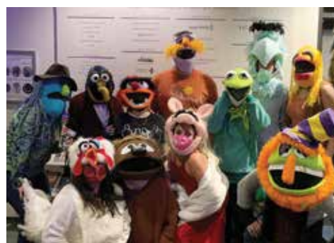
above: Quajay DeTOUR left: Museum of the Dead