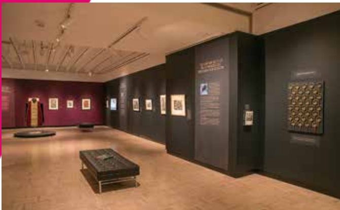
left: Renaissance Impressions exhibition