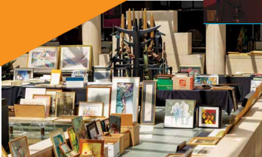
clockwise from upper left: Hispanic Heritage Celebration Day Pride Celebration in the Sculpture Park Art in Bloom floral display inspired by Portrait of Qusuqzah #6 by artist Mickalene Thomas Art & Treasures Sale