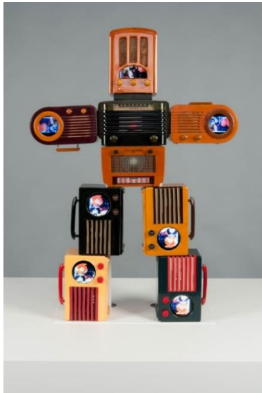
Nam June Paik (American, born Korea 1932–2006)

Here are artists with roots in Korea, Japan, India, and Vietnam. Click the images to learn more!