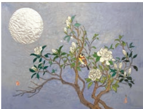
Pictured is Alice's painting Moonlit , from our most recent Faculty Show.