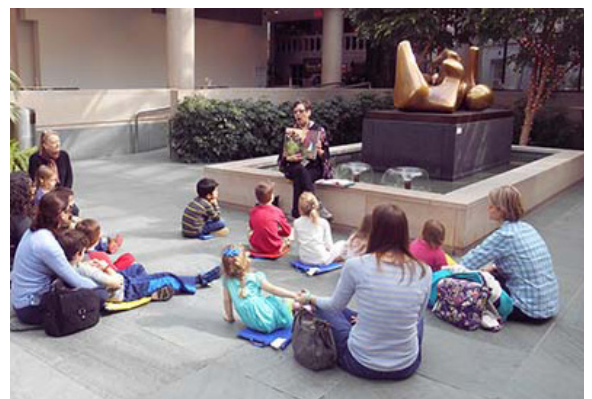
Art & Story Stroll participants in the Wilson Gallery, March 2017