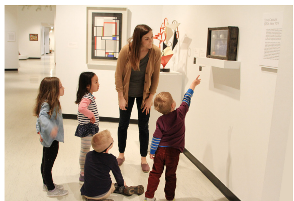
Art & Story Stroll participants in the Wilson Gallery, February 2017