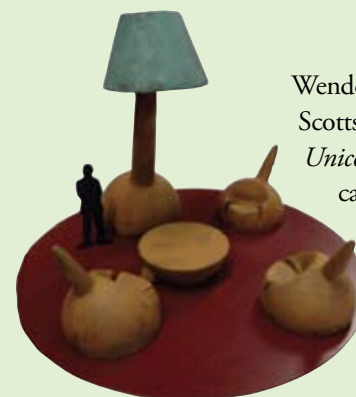
Wendell Castle, Scottsville, NY Unicorn Family cast iron with LED lamp; 22' in diameter gift of the Feinbloom family coming in 2013