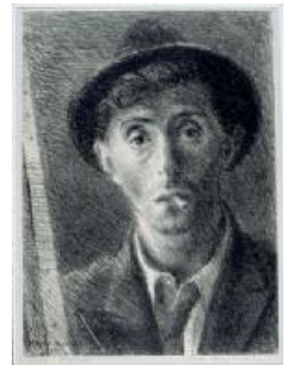
right: Self-Portrait , 1933 Lithograph Gallery Purchase Fund, 38.37